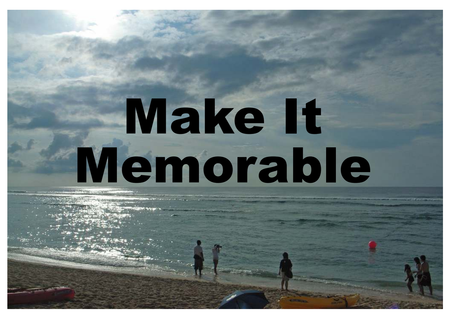
Creative Commons photo by tata aka T